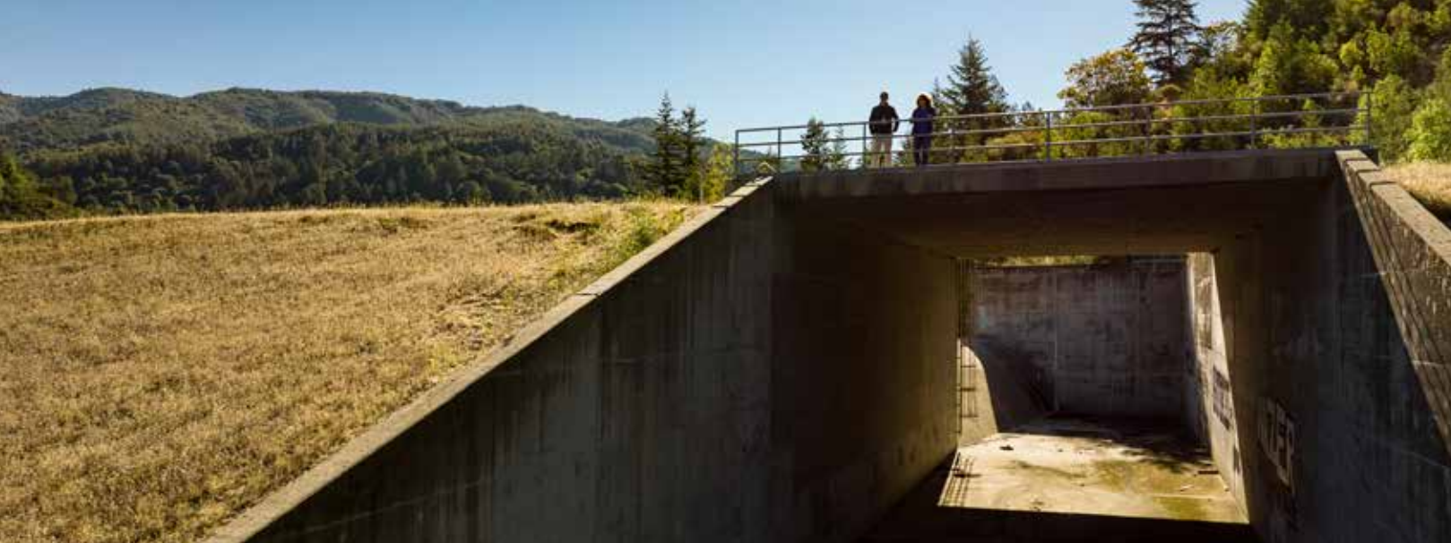
San Jose Water Staff at Austrian Dam.