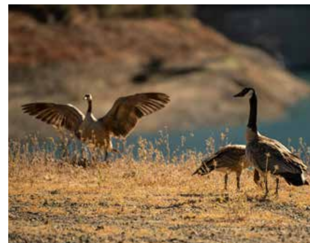
Wildlife rests in the San Jose Water watershed.