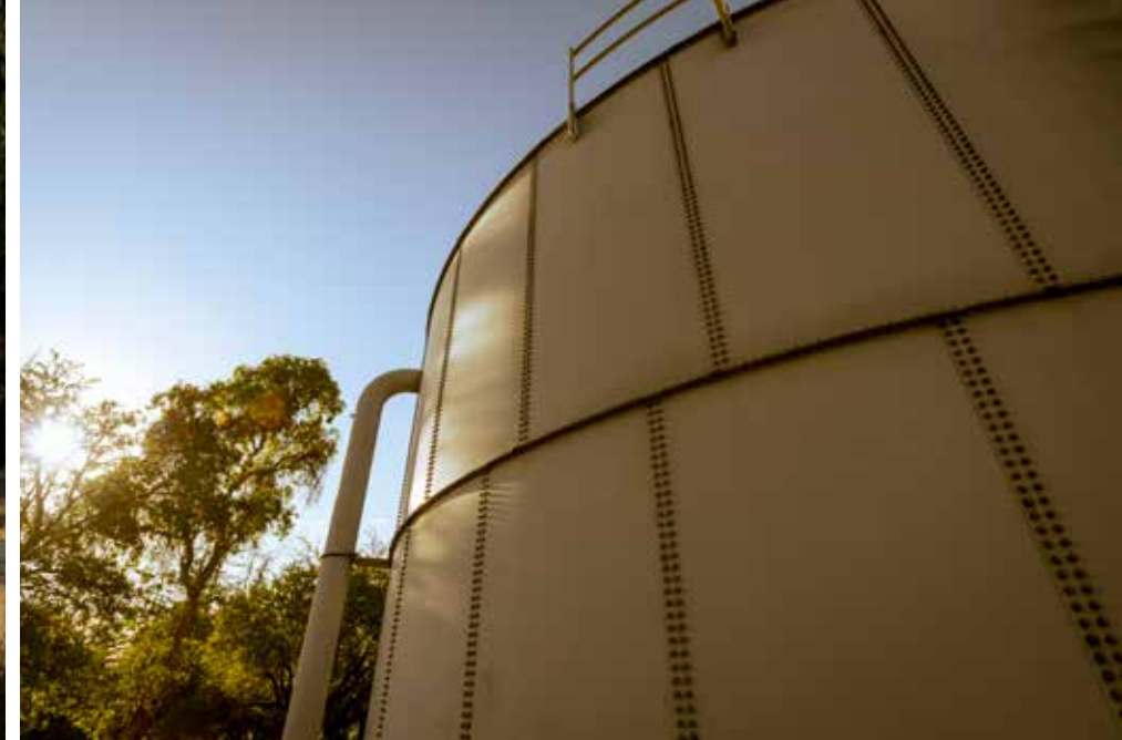
Williams Station wells.