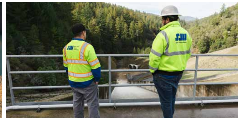
San Jose Water staff survey the Lake Elsman spillway.